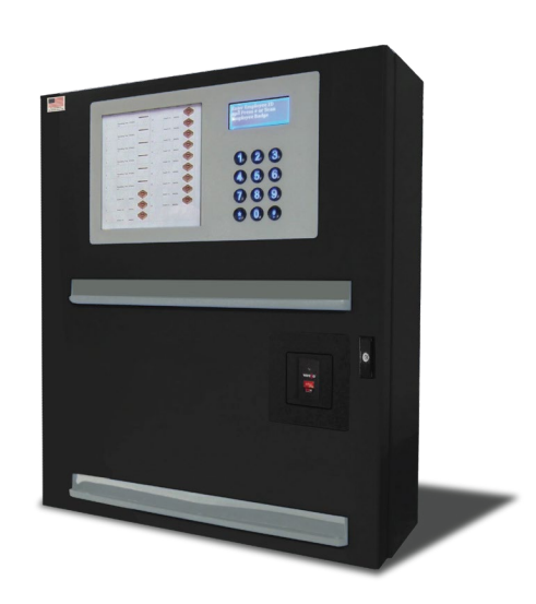
SOLO 100 Series

Works with your existing access control system so there's no disruption to the workflow.