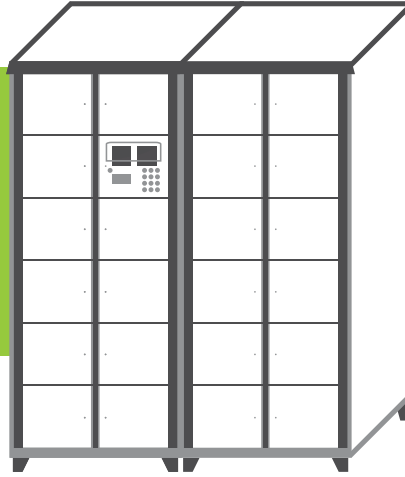
Access 6823 23-Door Locker