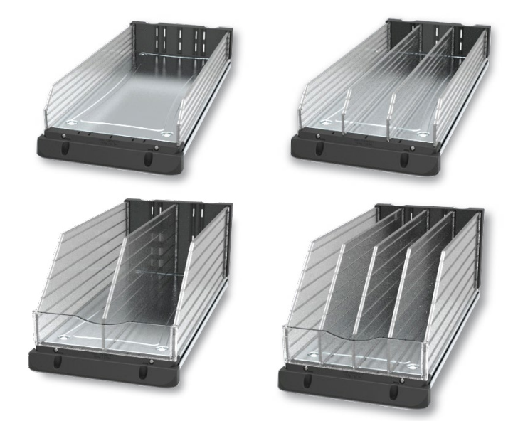
Combine short and tall divider walls to organise and dispense everything from small parts to bulky and irregularly shaped items.

Compartments are brightly illuminated. Door handle lights up blue to guide user to selected compartment.